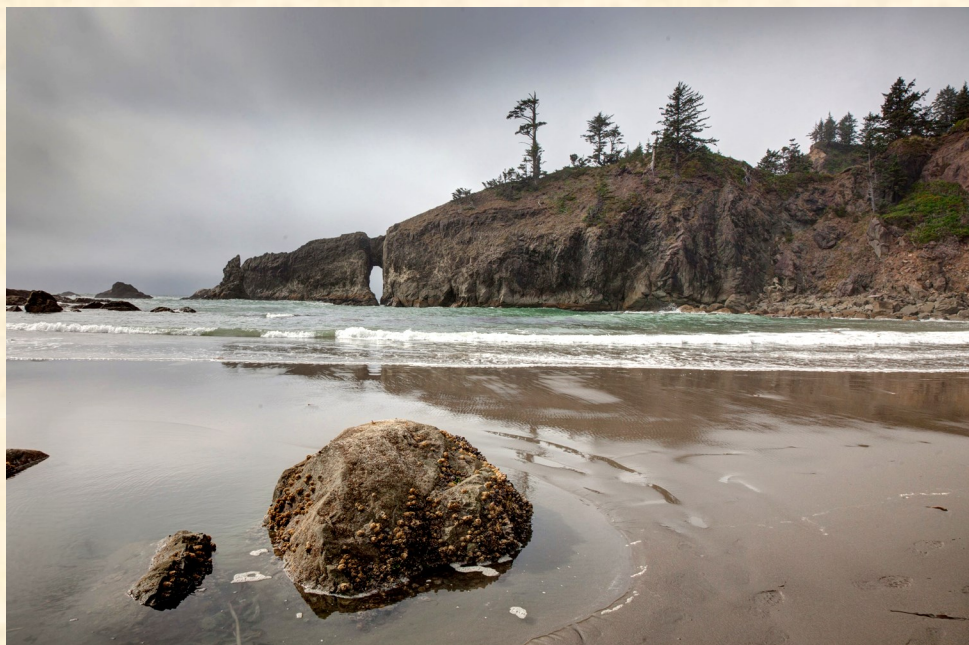
Sea arch eroded from sandstone and breccia of the Hoh assemblage, Second Beach, Olympic National Park.