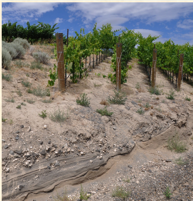
Vineyard rooted in Missoula flood sands and gravels, Red Mountain AVA.