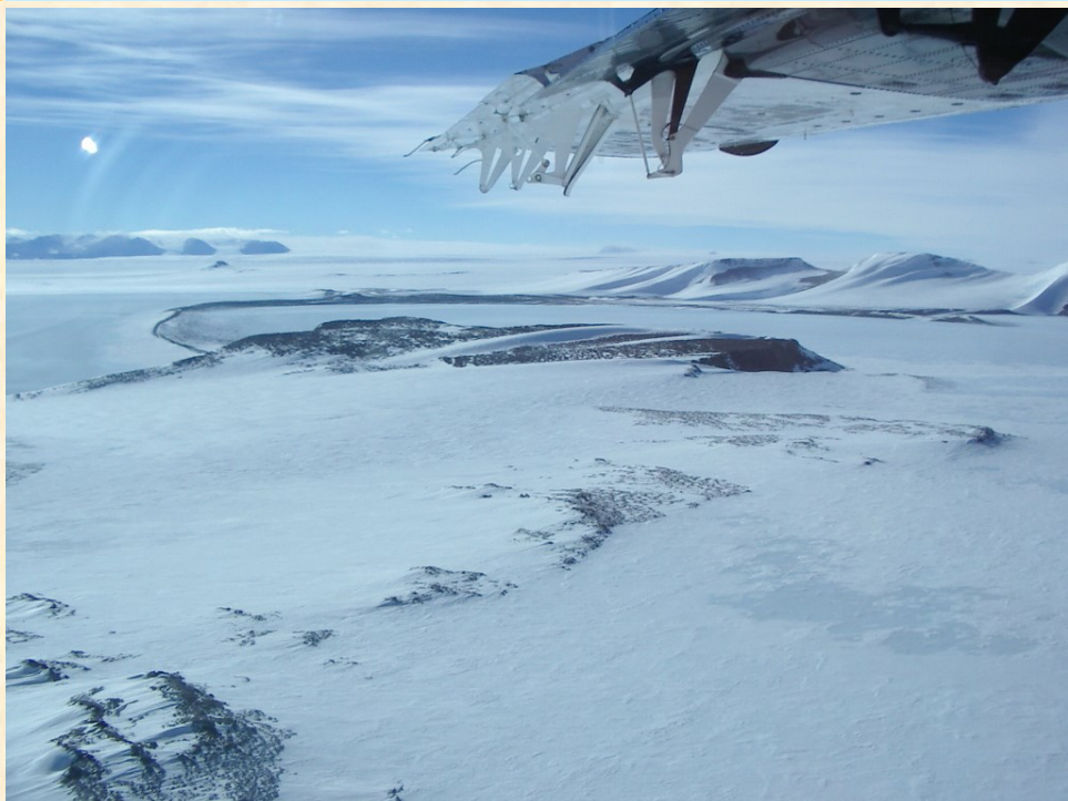
Aerial view of Antarctica, an ideal hunting-ground for meteorites.